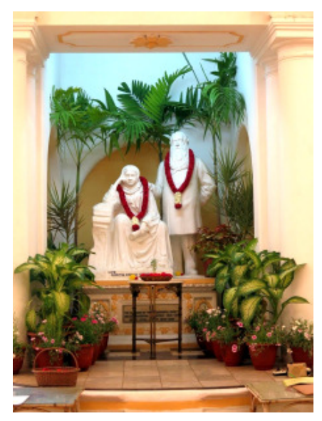
The Statues of the Founders

read passages from the three books and expressed their silent gratitude for the sacrifices made by HPB to bring the light of theosophy to the world.