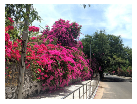
Pretty summer blooms, empty roads!

The bougainvillea creepers in the Besant Gardens side of the TS compound, spill over to the pavement outside the campus, along with their bounty of colourful blooms, providing a glorious splash of colour to the unusually deserted Besant Avenue road.