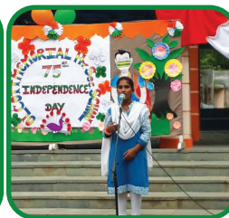
An OMHSS student gives an Independence Day speech