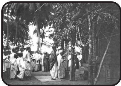
Consecration of the Buddhist shrine in December 1925. C. W. Leadbeater performs the ceremony while Annie Besant and Krishnaji look on

'The foundations have been laid of a small Buddhist shrine at Adyar . . . near the Olcott Memorial, which marks the spot where Colonel Olcott's body was cremated. In front of the shrine is a pond where pink and white lilies bloom in profusion and at one side, about 200 yards from the shrine, the Adyar River flows down to the sea . . . The design of the shrine is a combination of two styles . . . the base of the shrine, with its rounded arches and pillars, is taken from Buddha-Gaya, whilst the cornices and the dome are from a Buddhist temple in Nepal.'