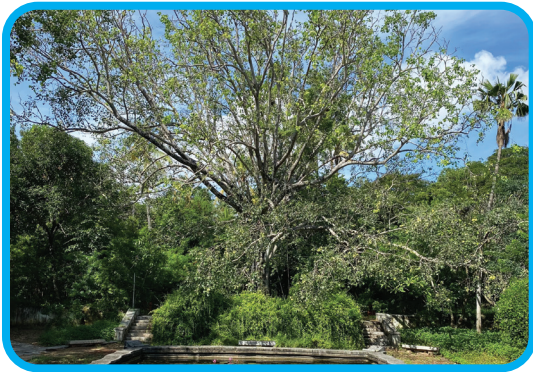
The Bodhi tree

in the selected spot, straight opposite the Buddhist Shrine, the two monks chanted Pali verses of benediction. This was a favourite meditation place of Col. Olcott, where he built a seat with the pond in front of the shrine and a wide view of the Adyar River.