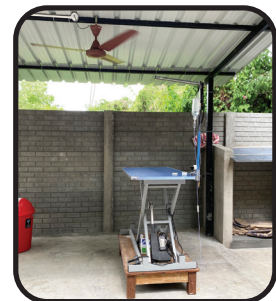
Examination area in the new OP Unit