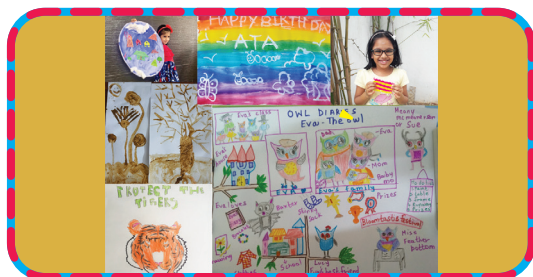
Posters exploring India, Nature, stories and the world