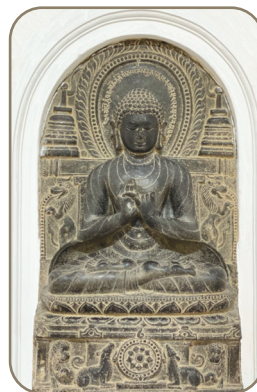
The image of the Buddha

The image represents the First Sermon, 'Setting in Motion the Wheel of Dhamma', which was delivered in the Deer Park at Sarnath, near Benaras. Hence, the wheel and the two deer, below the image.