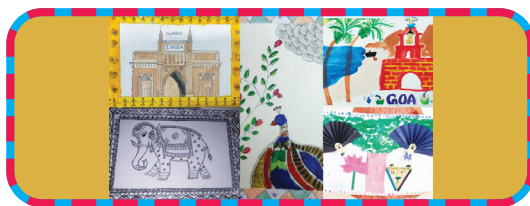
Students celebrating the art forms of India

Year Three, the many wonderful educators who have put in time to connect with the students and regularly update their skills with myriad, year-round workshops, say they are excited and eager to resume classes (albeit online), with a focus on intrapersonal skill development and storytelling which breathes life into deep discussions on varied topics.