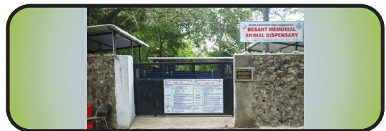
Entrance to the new OP unit