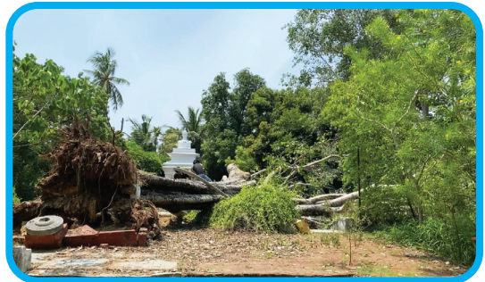
The fallen Bodhi tree

sudden fall — like a strong wind, or torrential rain. Therefore, the logical conclusion was that the reason(s) was hidden within the tree itself. And this surmise proved correct.