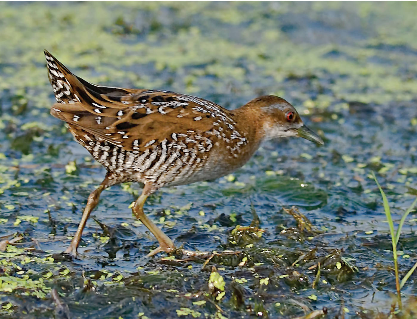
Baillon's Crake Foraging for Food