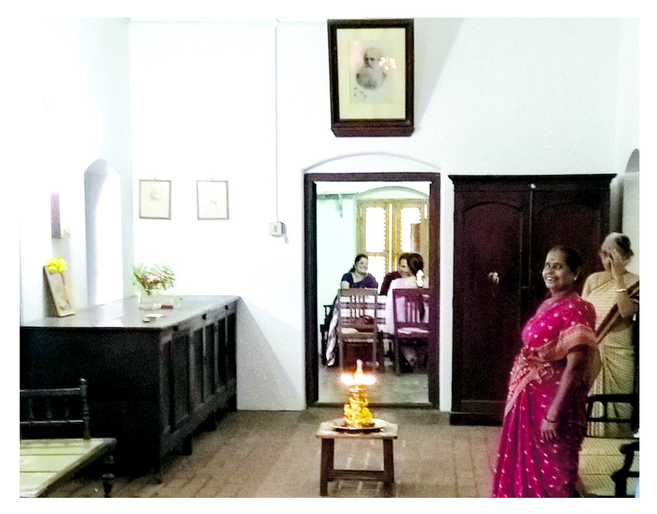
The sacred lamp in front of the doctors' consultation office