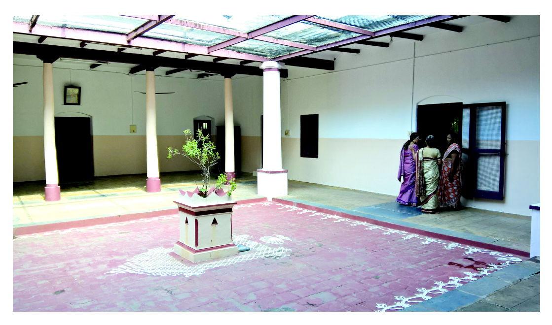
Open central patio of the Bhojanasala, where therapeutic yoga exercises are to be conducted