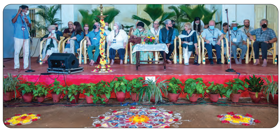
Opening of the Convention with representatives of the countries on the dais