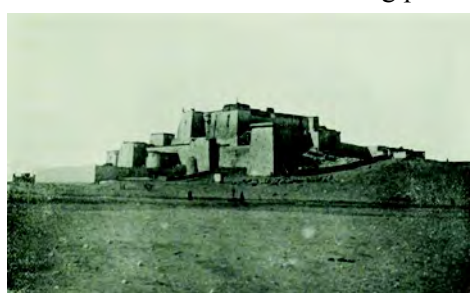
Pari-Yong monastery, mentioned by Master KH in his letter to Mr Sinnett (photograph of 1903,)

The envelope with your crest on had nearly disappeared, the contents of the letters been made illegible — in short, I was perplexed at the sight of the disaster. Now you know why I felt embarrassed: I had no right to restore it, the letters coming from the "Eclectic" and connected directly with the hapless "Pelings" on all sides. What could I do to restore the missing parts!