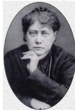
Helena Petrovna Blavatsky

It is a striking thought that in her death and commemoration request, as in her life, HPB asked nothing for herself except that the work to which her life had been dedicated, should continue. Keep the link unbroken , was how she expressed it.