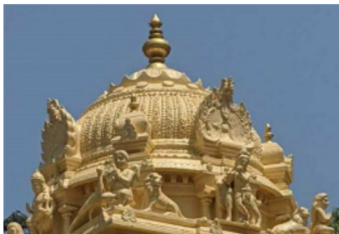
Bharata Samaja Temple dome

The Bharata Samaja Temple or the Temple of Light with its finely sculptured dome was one of them. It is situated just off the Founders' Avenue. The novel idea in this temple is that there is no image whatsoever of any aspect of the Deity, but only a burning lamp, for Light is recognized by Hindus of all the various divisions of Hinduism, as a symbol of God. Here, at sunrise every morning, the beautiful Bharata Samaja Puja is performed.