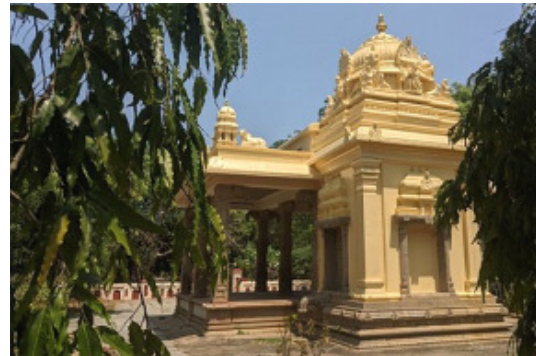
Side view of the Temple

The main focus of the Bharata Samaja was to bring to light the essential teachings of Hinduism. And hence, in the daily ritual, an attempt has been made to distil the very essence and content of the Hindu form of worship and shed all the unnecessary accretions and superstitions. However, scrupulous care was taken to retain the essential ancient verses from the Vedas.