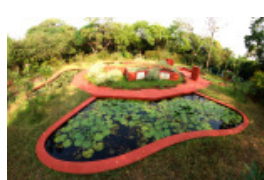
A view of one of the leaf-shaped lily ponds