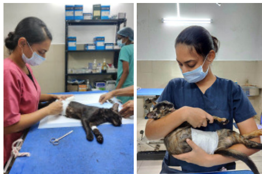
Cat ABC surgery in progress

residents who have developed close bonds with them through feeding and care.