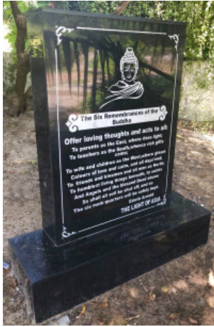
The new granite plaque with the Six Remembrances of the Buddha