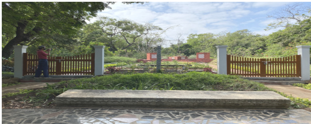
Entrance to the Garden of Remembrance

One of the most beautiful and hallowed spaces on the Adyar estate is the Garden of Remembrance, a quiet nook located on the north-east corner of the main campus, beside the river path. The site was originally consecrated by Annie Besant on Vaisakh Day, 17 May 1917, as the foundation for Suryashrama , a temple for the Order of the Brothers of Service. Circumstances decreed that Suryashrama should not be built, and after Dr Besant's passing, her body was cremated at this spot on 21 September 1933, and her ashes buried here. The following year, some of the ashes of C. W. Leadbeater, who had been cremated at Sydney, were also brought and interred here.