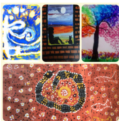
Beautiful paintings by the ATA students

In the new normal that is prevalent in these Covid-ridden times, ATA's classes have been online for almost a year. Yet, strong bonds were formed and joys shared. Science, Maths, Arts, Perspective Building and much more happened through stories which breathed life into the small window on the computer screen that has taken the place of ATA's airy and beautiful classrooms.