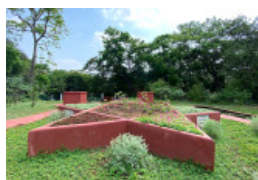
The terracotta star with interlaced triangles