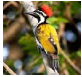
Lesser Flame Back Woodpecker

The majority of our bird population comprises the insectivorous birds whose main food are insects of every description and include the Small Green Bee-eater, Black Drongo, Tickels Blue Flycatcher, the gorgeous Paradise Flycatcher, Common Nightjar, Indian Roller, Hoopoe, the dainty little Tailor Bird, and the Lesser Flameback Woodpecker. Among the Nectarinivores (birds whose main diet is nectar from the flowers), three species of sunbirds - the purple, purple-rumped, and Lotens sunbird and flowerpeckers, are found here; but birds like mynahs, magpie robins and tree pies are also included in this category, since they too are partial to the sweet nectar, and thus help in cross-pollination. The majestic, red silk