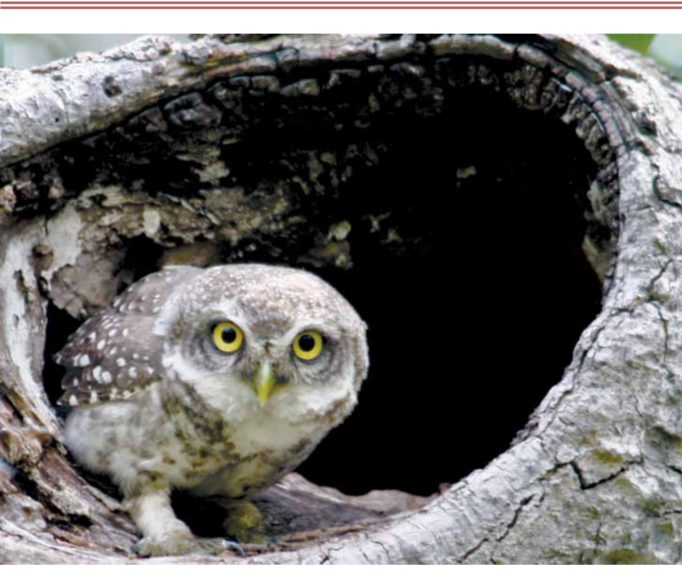
A Spotted Owlet peeps out of a hole in a Banyan tree