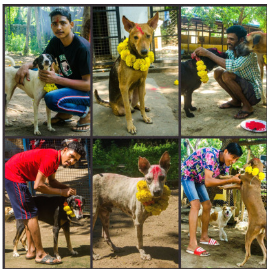
Kukur Tihar celebration at BMAD

While for centuries, dogs have been labelled as 'man's best friend', offering companionship and loyalty to their human counterparts, in Nepal however, this cherished and special bond between dogs and humans is celebrated with a unique festival, Kukur Tihar (meaning worship of dogs). As most of the caregivers at BMAD are from Nepal, it is only natural that this festival is also celebrated at BMAD with great joy and enthusiasm. On Diwali (the Hindu festival of lights) day, which also happened to be the day of Kukur Tihar , the caregivers and volunteers draped flower garlands around the necks of the dogs, applied tilak (a powder made from red colour and rice flour) and gave them special food and lots of loving care. And needless to say, both dogs and humans enjoyed themselves immensely!