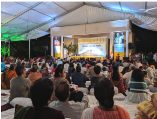
The well-lit Adyar theatre

A series of open air concerts have been organized by SPIC MACAY under the banner, 'Music in the Park' in different locations across the country, with the support of the SRF Foundation. On 19 October 2019, the venue was in Chennai, in the verdant and lush TS campus, where two veteran maestros — Pandit Jasraj and Vikku Vinayakram — came together to provide divine and soul-stirring music to the enraptured Chennai audience. The concert, performed against the backdrop of the South West monsoon, with cloudy skies and bursts of rain, was a thrilling experience for all who attended the concert. To protect the audience from the rain, a white marquee was erected. Thickly cushioned mattresses were laid out, with bolsters placed all over for the audience to sit back and savour the music.