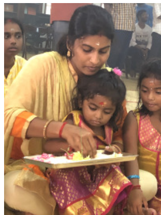
A child traces her first letters on grains of paddy, sitting on her mother's lap