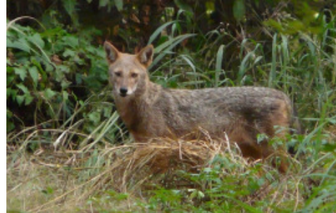
Indian jackal photographed on the campus

they were heard howling on the riverside path by a resident who was taking an early morning walk with her cat! And we are hopeful that this beautiful animal, the top predator in our ecosystem, will return to the campus, in significant numbers.