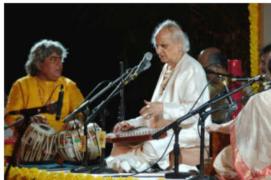
Pandit Jasraj performing at the concert