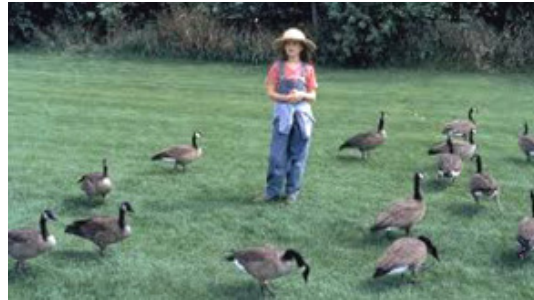
Amy with the flock of geese — a still from the movie

In a slight departure from its usual practice of screening nature documentaries, ANEC screened a beautiful nature-themed movie, Fly Away Home , for the members and the interested public. Based on a true story, the film depicts the soaring adventure of a 13-year-old girl, Amy, and her estranged father, who learn what family is all about when they adopt an orphaned flock of geese and teach them to migrate before the onset of the harsh winter.