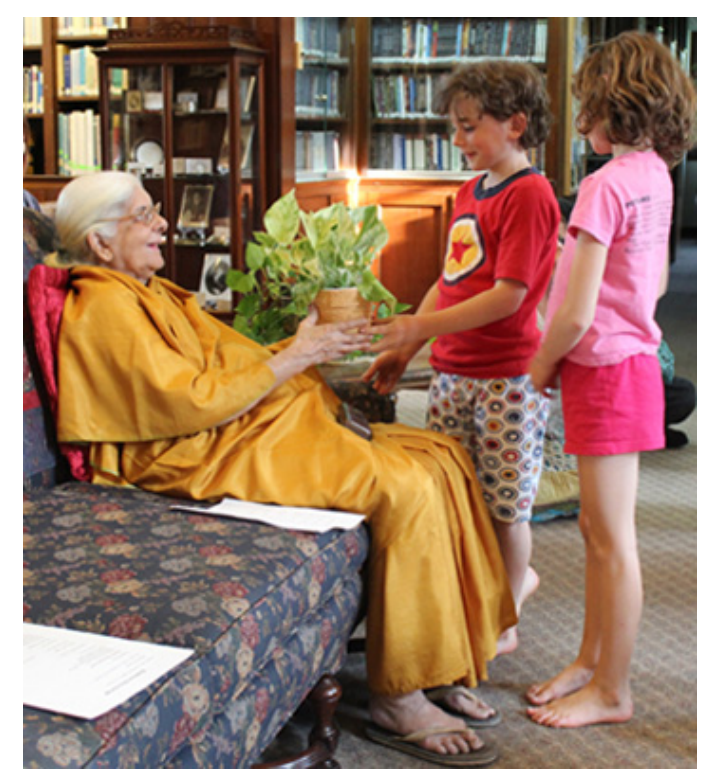
With youngsters of the school run at Wheaton