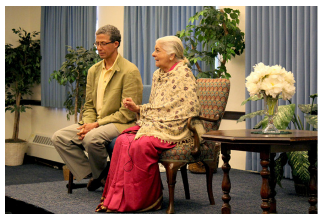
The American and International Presidents