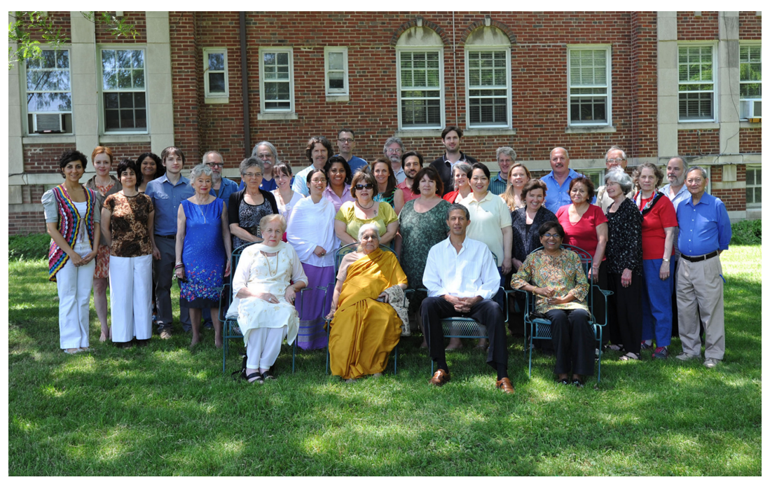
The workers of the American Section