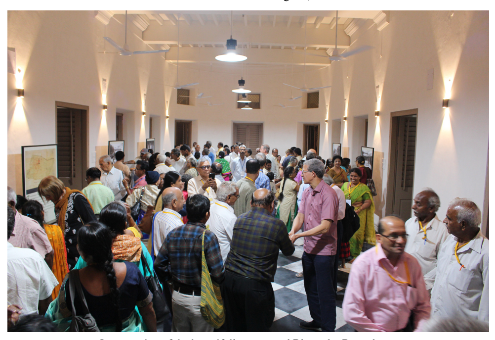
Inauguration of the beautifully renovated Blavatsky Bungalow on 1 January 2019, with President Boyd greeting Convention delegates