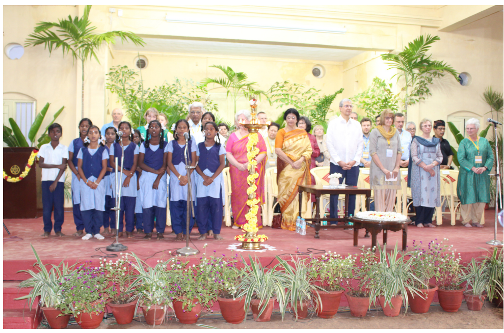
Opening of International Convention of the TS at Adyar Headquarters, 31 December 2018, with Olcott Memorial Higher Secondary School students singing a prayer