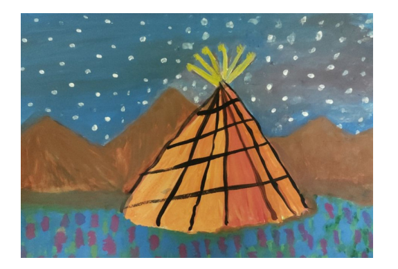
A student's rendition of a Tepee against a starlit sky