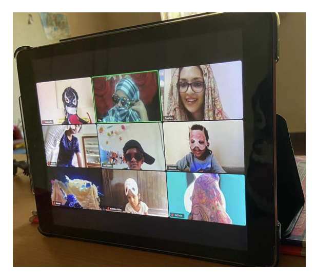
Snapshot of an online session. Students come dressed as their favourite characters ahead of Halloween