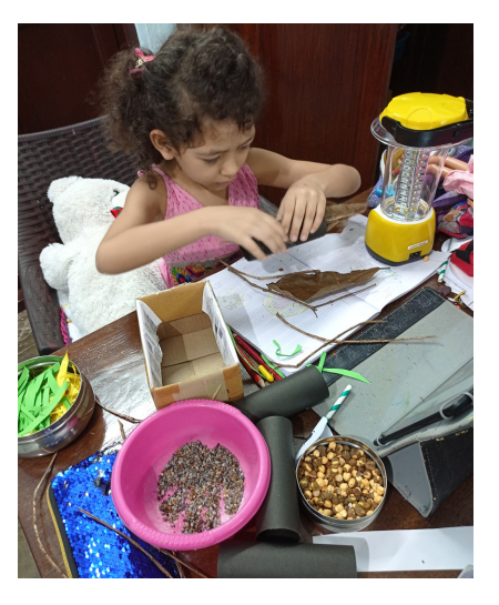
A student works alongside her classmates on the screen to build a Hotel for Bugs