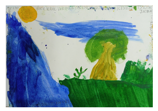
Nature Journaling, a weekly session of expression and creativity