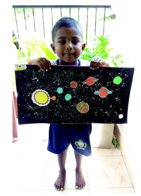
Holding up a painting of the Solar System, created as part of the "Into Space" exploratory project