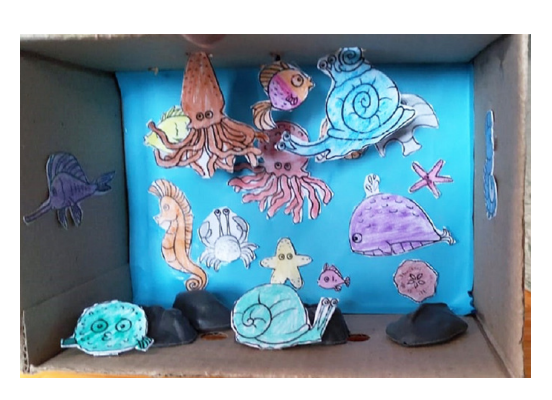
An "under the sea" diorama by our pre-KG student