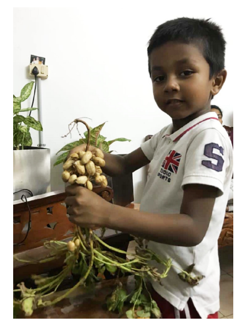
A student harvests groundnuts