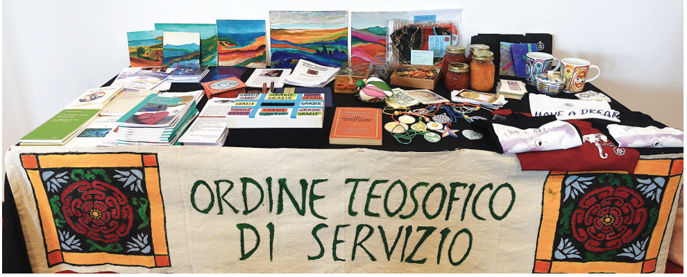
The Italian Section Theosophical Order of Service charity bazaar