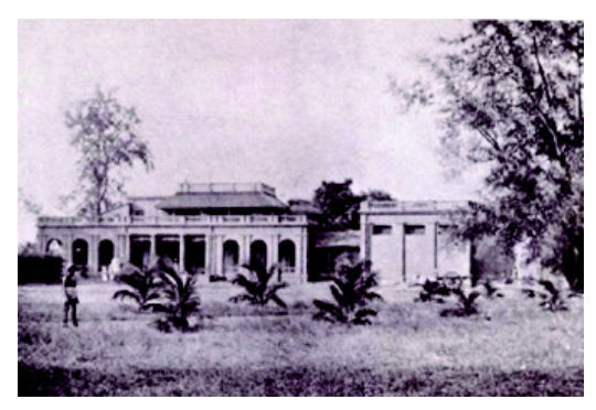
Adyar (circa 1882)

The reader should also know that Swamiji was never a Fellow of the TS (!!!) nor ever expressed a desire to be one. The only relation which he suffered to have been made consisted in his accepting to be their Instructor in the Vedas.