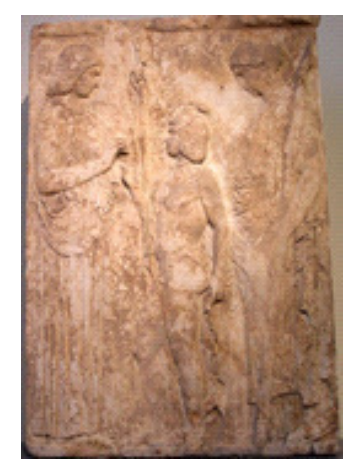
Initiation in the Eleusianian Mysteries