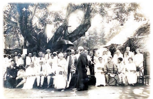
1925 Convention gathering under the banyan tree including Annie Besant, C. W. Leadbeater, and others

The Golden Jubilee Convention held in 1925 was memorable in many ways. It was the biggest Convention ever to assemble, with 3,000 delegates, of whom 500 came from overseas. Loudspeakers were used for the first time during the Convention. The Bharat Samaj Temple was consecrated, and shrines of other religions were in various stages of construction. The Prayers of the Religions were offered for the first time, with the President leading the closing prayer, 'O Hidden Life, . . .'. A message to the Members of the Theosophical Society was received from an 'Elder Brother'.