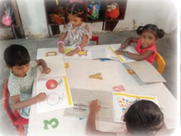
Tiny tots learn numbers, alphabets and colouring