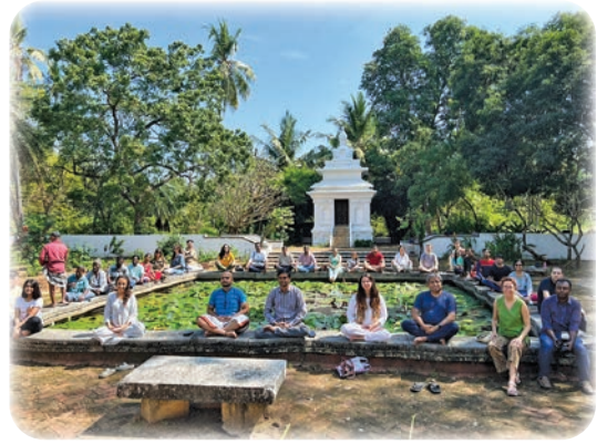
Youth Convention delegates at the Buddhist Shrine

The Young Theosophists had a twoday conference prior to the starting of the Convention, with participants from India and other countries too. They studied Bishop Leadbeater's book, The Hidden Side of Things . They also enthusiastically volunteered their services in the conduct of the Convention, adding zest and vibrancy to the proceedings.