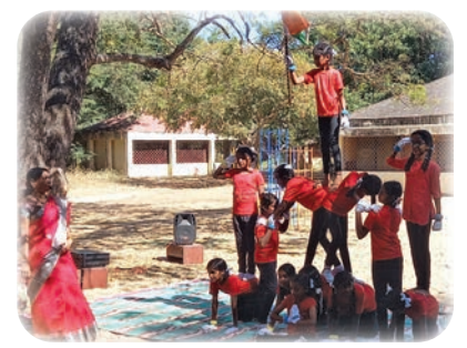
Junior School gymnastics during the Sports Day