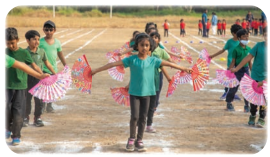
The graceful fan drill by Grades 1 & 2

Andhra Pradesh, with visits by students to each other's school. It was an enriching experience for the students as they engaged in stimulating conversations, exchanged ideas and participated in many Naturebased activities.