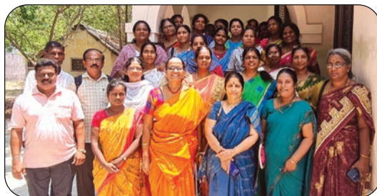
Professional development programme attendees

After the summer break, OMHSS reopened for the middle and senior school on 12 June 2023, while the junior school reopened on 14 June. Prior to the reopening of the school, there was a professional development programme for the OMHSS teachers, spread over three days, covering areas like the handling of emotions, teaching techniques for various types of learners and the use of planning, teamwork, concentration, and strategy, for making the teaching-learning process more effective.