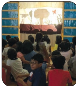
Shadow Puppet show