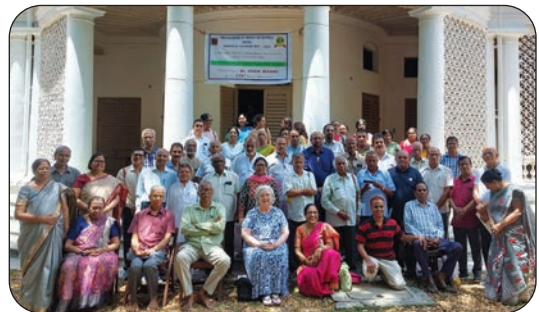
Participants of the TOS National Conference

The Conference concluded with a presentation of the TOS activities by various regional groups, the annual general body meeting of the TOS India, and meaningful deliberations on the roadmap for the future.