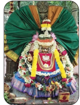
Ponni Amman shrine