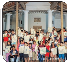
The young children proudly show off their creations