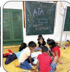
ATA children at work