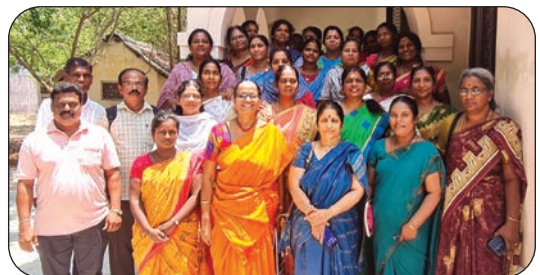
Professional development programme attendees

After the summer break, OMHSS reopened for the middle and senior school on 12 June 2023, while the junior school reopened on 14 June. Prior to the reopening of the school, there was a professional development programme for the OMHSS teachers, spread over three days, covering areas like the handling of emotions, teaching techniques for various types of learners and the use of planning, teamwork, concentration, and strategy, for making the teaching-learning process more effective.