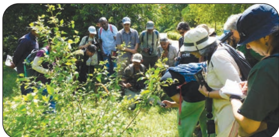
ANEC-MNS Nature walk participants