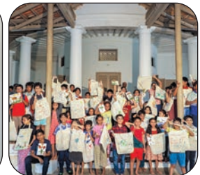
The young children proudly show off their creations