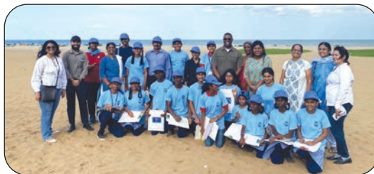
OMHSS students at Elliott's Beach

which they then successfully explained to Mr Michael Regan, US Minister for Environment, who was in the city to attend the G20 summit. A truly proud moment for Olcott!