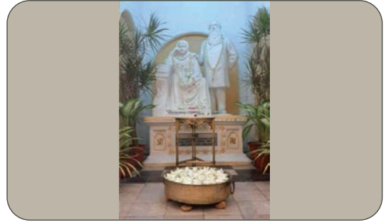
White Lotuses offered to the founders' statues