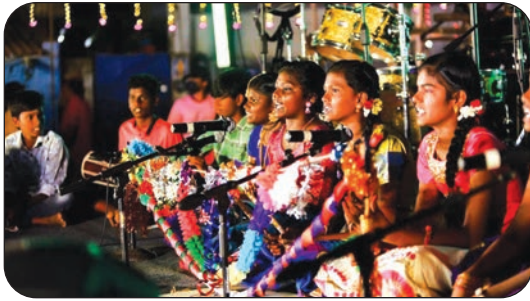
Villu Pattu performance by OMHSS students

A delightful reunion was organised by the 1999 batch alumni, who came from far and near, some even bringing their families!