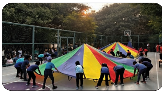
Students immersed in Games Day activities