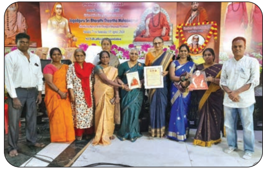
ALRC staff proudly pose with the Award