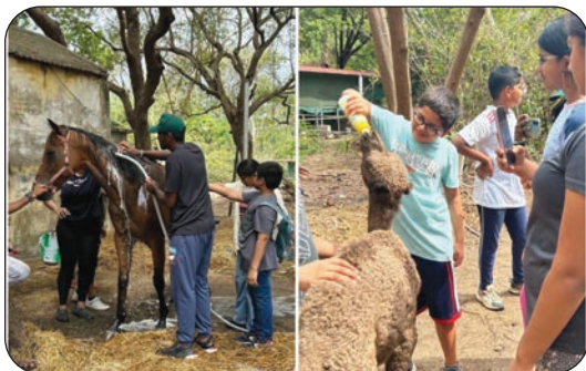
Bathing a horse, feeding the camel baby!

It was a fun-and activity-packed programme, but also one where the learning happened at different levels. Apart from the physical skills gleaned, these youngsters imbibed important lessons about compassion and reverence for life, and how to be gentle and kind and make a difference to the lives of abused and suffering animals. The eternal values of sharing and caring, so essential in today’s fast-paced world was instilled in a subtle manner.