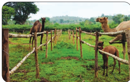
Rescued camels at the Backwater Sanctuary

beautiful shelter in Kabini, Karnataka, that already has another rescued camel (also from BMAD). A heart-warming tale with a fairytale happy ending!