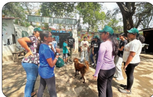
Learning about canines and their care