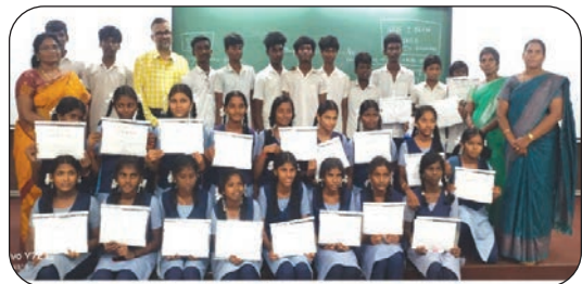
Symposium on Cyber Security at IIT Madras

In March, esteemed NASA scientist, Swati Mohan, conducted an inspiring workshop