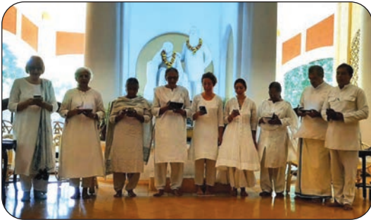
The Adyar Choir