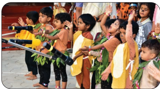
Tiny tots captivate hearts with their vibrant performances