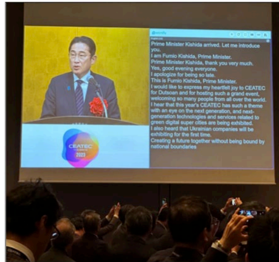
Prime Minister Fumio Kishida CEATEC 2023 | Japan