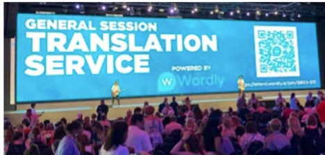
MPI WEC | Main Stage - Mexico

During the World Congress, translations into multiple languages will be available using mobile phone based on live artificial intelligence (AI). Delegates are advised to bring their own earphones if they wish to listen to the audio translation, or they can read the live translations on the phone screen. A chosen language may be reflected to the big screen at the hall showing the captions. Below some examples are shown.