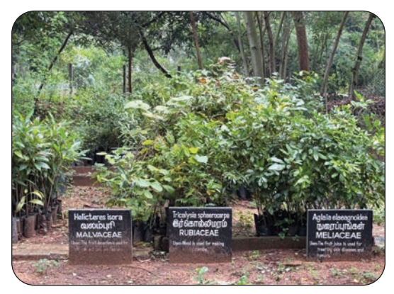
TDEF saplings awaiting planting in the nursery