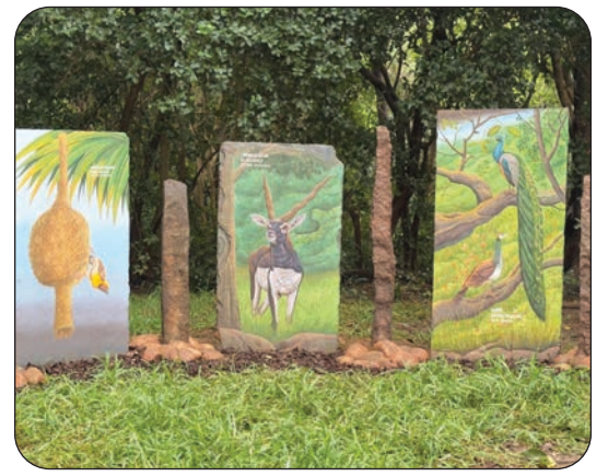
Some of the artworks on stone slabs

create seating spaces that invite more gentle dialogue and sharing among community members in an idyllic environment.