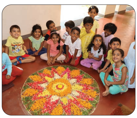
Young ones making 'Pookolam' for Onam festival

The ATA Film Club screened Studio Ghibli's The Boy and the Heron , inspiring students from Grades 4 to 7 to analyse its emotional depth and theme. There were also cultural celebrations of festivals — Krishna Jayanthi, Vinayak Chathurthi, Onam, and Diwali. ATA's blend of academics, cultural immersion, and environmental stewardship ensured a dynamic and holistic learning environment for the students during this term.