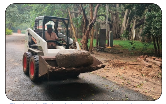
The handy 'Bobcat' moving boulders on the estate