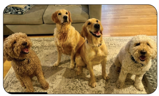
Dory and Jamun in their new USA home

Fighting disease, life-threatening injuries and horrific abuse of street animals on a daily basis, the BMAD staff plough on valiantly, savouring their success stories and refusing to allow adversities to affect their spirits and their work. One such is the happy story of two abandoned golden retrievers, Dory and Jamun, that came to BMAD in a pitiable condition. While Dory was suffering from severe hepatitis and jaundice, Jamun when abandoned on the streets had been badly mauled by street dogs and had maggot infested puncture wounds all over her body. Miraculously, both dogs responded positively to the medical treatment and love given to them