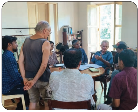
AED meeting in the Olcott Bungalow

Convention at Adyar. The insides of the bungalow will soon be filled with artworks, exhibits, books and information displays as it becomes a place of awe, inspiration and deep learning about the local ecology and our inexorable connections to it.