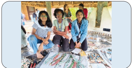
Where hands create, and minds imagine — ATA students at Marudham Farm

Field-trip destinations included Guindy National Park, Mahabalipuram, the Rain Centre, Higginbothams Bookstore, the Besant Nagar Post Office, and IIT Madras. A small group also travelled to Marudham Farm School in Tiruvannamalai, where they learned about sustainable living and traditional crafts. A highlight of the term was the visit to the Fine Art educator's solo exhibition, Between Petals and Silence , at Ashvita's Gallery, where students saw how art evolves from observation to expression.