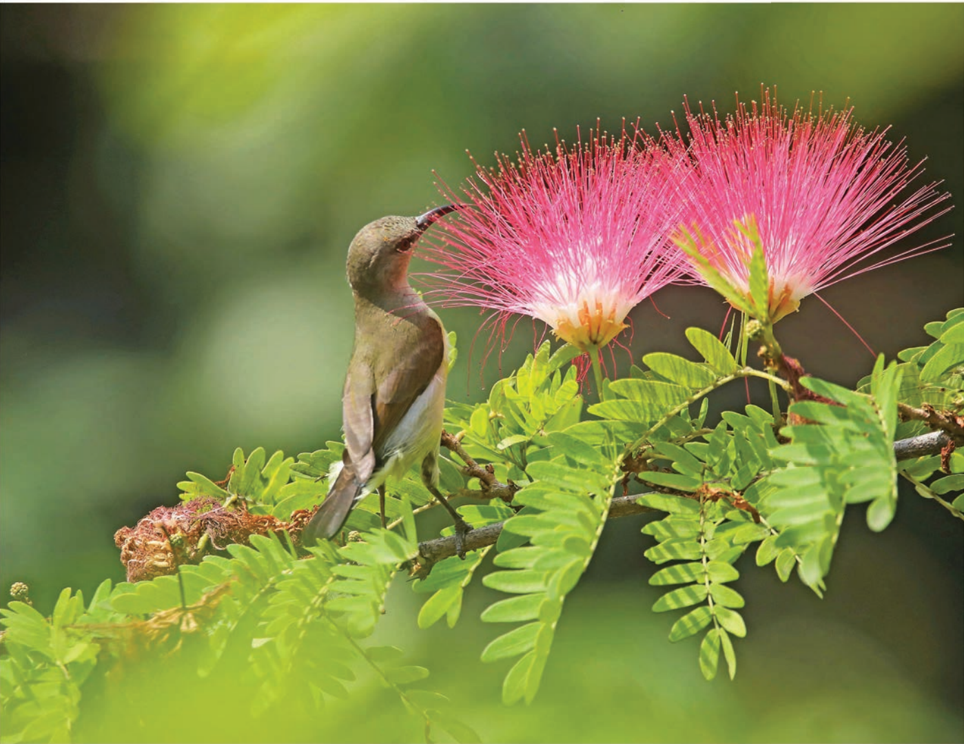
Purple-rumped Sunbird and Red Powder Puff Flowers