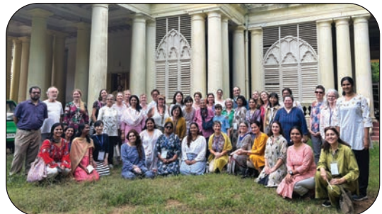
Association Montessori Internationale members