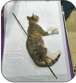
The seriously injured cat

This quarter also brought moments of intense rescue and recovery. A critically injured cat, found impaled on a metal rod, was rushed to BMAD and taken into emergency surgery. Fortunately, no major organs were damaged, and the rod was safely removed. The cat is now stable, alert, and showing encouraging signs of recovery.