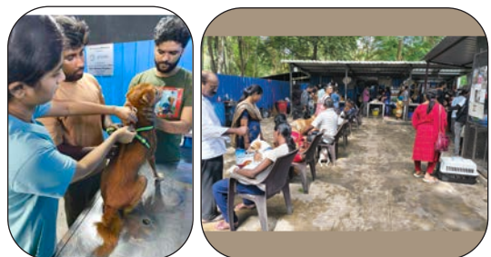
Long line of caregivers waiting for microchipping

greater accountability and safety of their companion animals across the city.