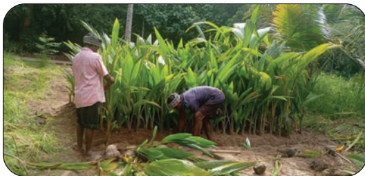
Gardeners transplant coconut saplings

Around 200 indigenous saplings were planted near the main gate to enrich local biodiversity. A major reorganisation of the coconut grove near the Administration Building saw 2,000 coconut saplings transplanted into dedicated sections. Attractive kadappa stones with painted motifs were installed in the refreshed garden between LBC and the Adyar river.