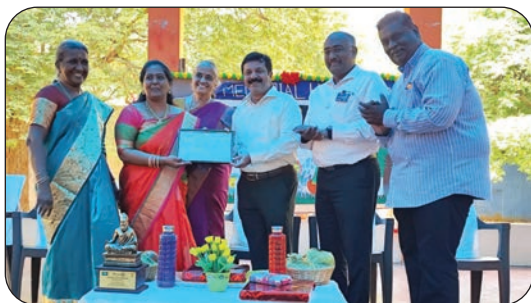
Teachers' Day award function