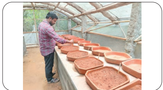
New germination shed in the nursery

In the nursery, tables were installed in the new bamboo germination shed, and seeds of species such as Walsura trifoliolata and Strychnos nux-vomica were sown in trays, with germination data updated systematically. Saplings of Saraca asoca , Mimusops elengi , and others were shifted into protective covers.