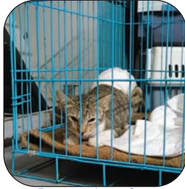
Recovering after life-saving surgery

BMAD's wildlife unit, working closely with the Tamil Nadu Forest Department's Headquarters Range, also oversaw the incubation of several clutches of rescued cobra and rat snake eggs. Over a monitored 60–80-day period, 24 out of 25 eggs hatched successfully, marking a significant milestone in their conservation efforts.