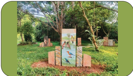
New paintings on granite grace the LBC garden

Later in November, Green Fellows — civil society members appointed by the Tamil Nadu Department of Environment and Climate Change — visited the BGC to understand its educational approach. The visit opened promising avenues for future collaboration and the wider implementation of BGC activities across the state.