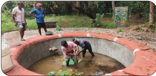
White lotuses to bloom anew in the restored pond beside the First Trilithon

The team continued close monitoring of the venerable Baobab tree behind Olcott Cottage, removing wood-borer-damaged sections and applying lime mortar to strengthen the weakened areas. The pond near the First Trilithon was restored through careful draining, plastering, and flooring to stop leakages, and will soon host white lotus blooms, long absent from the campus.